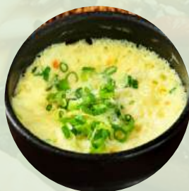
1 Side Dish