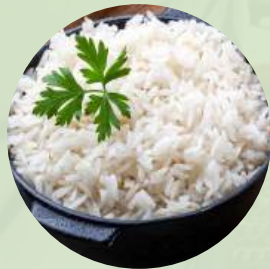
1 White Rice