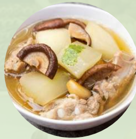
1 Nutritious Soup